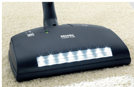
AllTeQ Combination Floor Tool (SBD 285-3) Electro Premium (SEB 236)