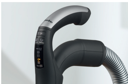
+/- Handle Controls